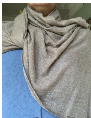
100% pure cashmere scarf