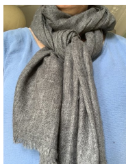
100% pure cashmere scarf