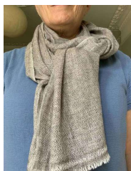
100% pure cashmere scarf