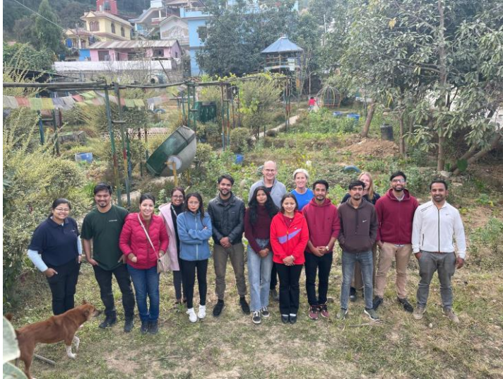
Trustee and student team-building day